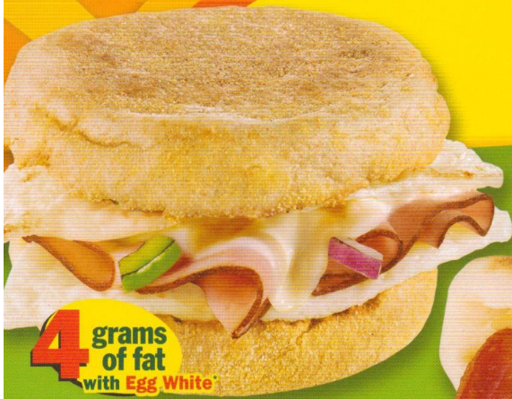
WESTERN EGG WHITE MELT ON LIGHT WHEAT ENGLISH MUFFIN