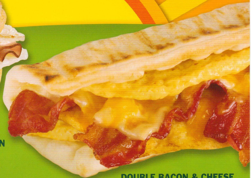
DOUBLE BACON & CHEESE OMELET ON FLATBREAD

Products may vary, available from opening to 11am at participating restaurants. *The Western Egg White Muffin Melt with egg white on light wheat English muffin is prepared according to standard recipe with meat, American Cheese and selected vegetables.