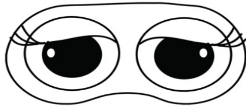
OWL HEAD Cut from kraft cardstock