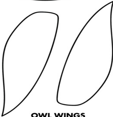
OWL WINGS Cut from kraft cardstock