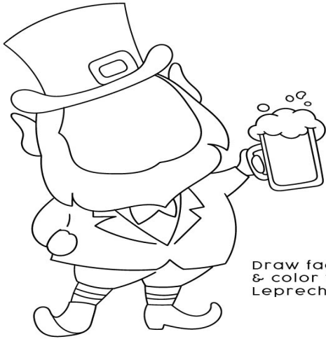
Draw face & color the Leprechaun