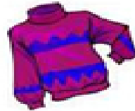
sweater / jumper / pullover