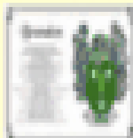
First Name with Last of Area Under Photo