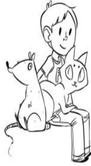
Rat, Cat, and Pat sat.