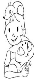
Rat and Cat sat on Pat.