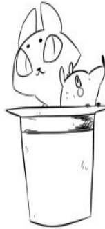
Rat and Cat sat in a hat.