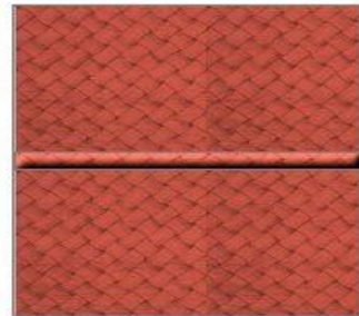
Roof fold Over and Glue in place