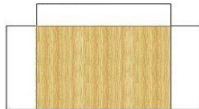
Middle Floor glue to inside Section.

Fold Back to create ground floor and Give Strength to base