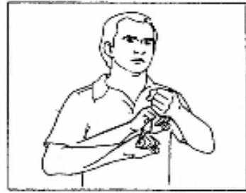
SUPPORT, sponsor, advocate