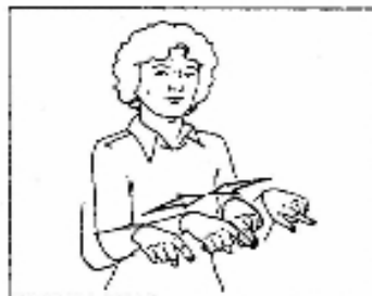
SAME, like, alike