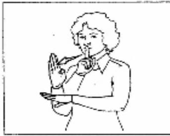
PROMISE, commit, pledge, swear