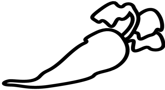
COLOR THE CARROT ORANGE