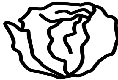
COLOR THE LETTUCE GREEN