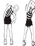
11. Lateral Flexion Stretch (one side, then the other, push pelvis across as you bend)