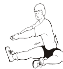
16. Hamstring Stretch (commence with knee slightly bent, then push knee straight as tension allows, push chest towards foot)