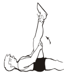
15. Hamstring Stretch (straighten leg) i. with foot pointed ii. with foot pulled back towards the knee