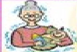
Grandmas to Spoil Us