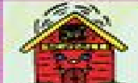
Schools to Learn In