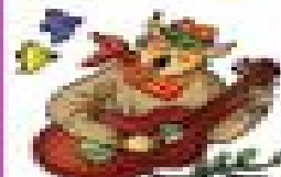
Music to Sing