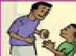
Fathers to Guide Us