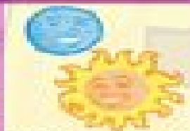
The Sun and The Moon