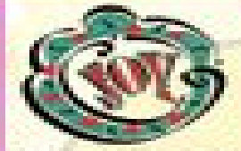
Emotions and Feelings