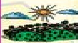
Meadows to Walk In