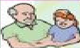
Grandpas to Teach Us