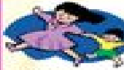
Brothers and Sisters