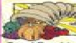
Good Food to Eat