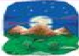
Mountains to Climb