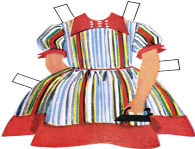
Betsy’s striped dress she wore when she ironed Susan’s dress