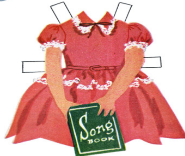
The rose dress with lace Betsy wore for the Easter assembly