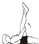
15. Hamstring Stretch (straighten leg) i. with foot pointed ii. with foot pulled back towards the knee