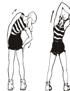
11. Lateral Flexion Stretch (one side, then the other, push pelvis across as you bend)