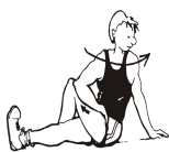
19. Gluteal and Lumbar Rotation Stretch