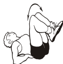
14. Lumbar Rotation Stretch (rotate legs one side, then the other side, draw in and brace stomach muscles at the same time, breathe)