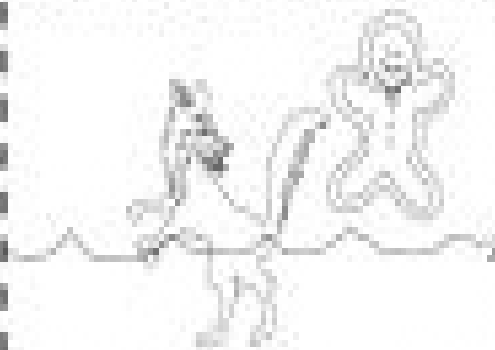
Let's make lunch for the gingerbread man!