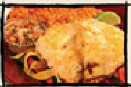
Florida Lime Chicken

A deliciously tender marinated chicken breast topped with sautéed mushrooms, onions, green peppers, and melted Monterey Jack and Cheddar cheese. Served with garlic Cheddar mashed potatoes, seasonal grilled vegetables and hot garlic toast. Regular KD 3.450 Large KD 3.950