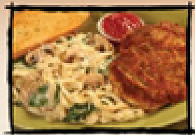
Parmesan Crusted Chicken