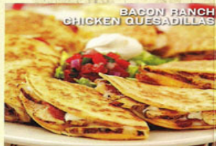
BACON RANCH CHICKEN QUESADILLAS

Three flour tortillas with tomatoes, cheese, lettuce, honey-chipotle drizzle and ranch dressing. 10.79