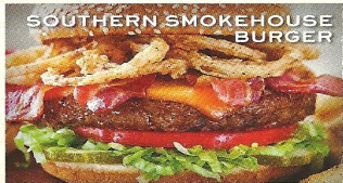
SOUTHERN SMOKEHOUSE BURGER