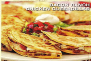
BACON RANCH CHICKEN QUESADILLAS

Three flour tortillas with tomatoes, cheese, lettuce, honey-chipotle drizzle and ranch dressing. 10.79