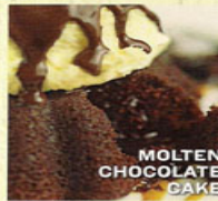
MOLTEN CHOCOLATE CAKE

Chewy bar of chocolate chips, walnuts and coconut. Topped with vanilla ice cream, hot fudge and caramel. 6.09