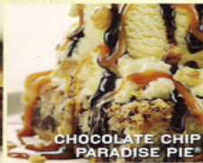
CHOCOLATE CHIP PARADISE PIE®