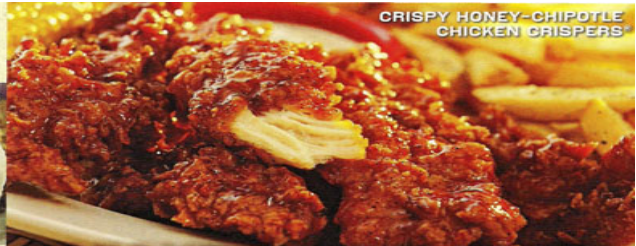
CRISPY HONEY-CHIPOTLE CHICKEN CRISPERS®