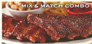
MIX & MATCH COMBO

Rubbed with spices & herbs, served with ancho-chile BBQ sauce.