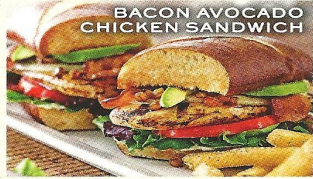
BACON AVOCADO CHICKEN SANDWICH

Try any sandwich with avocado slices for .75