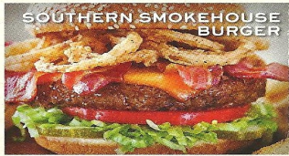
SOUTHERN SMOKEHOUSE BURGER