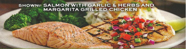
SHOWN: SALMON WITH GARLIC & HERBS AND MARGARITA GRILLED CHICKEN