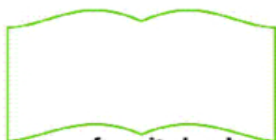
my favorite book