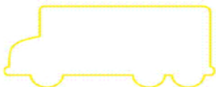
my favorite fieldtrip