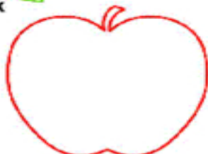
my favorite classroom activity