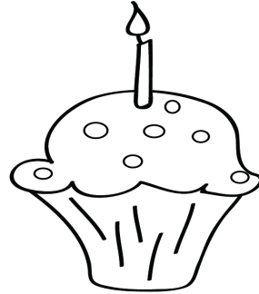
Color the Cupcake.