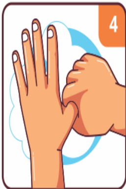
CLEAN YOUR THUMBS