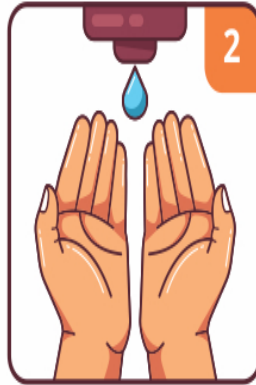
APPLY THE SOAP