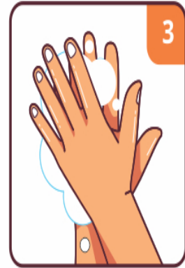
SCRUB YOUR HANDS