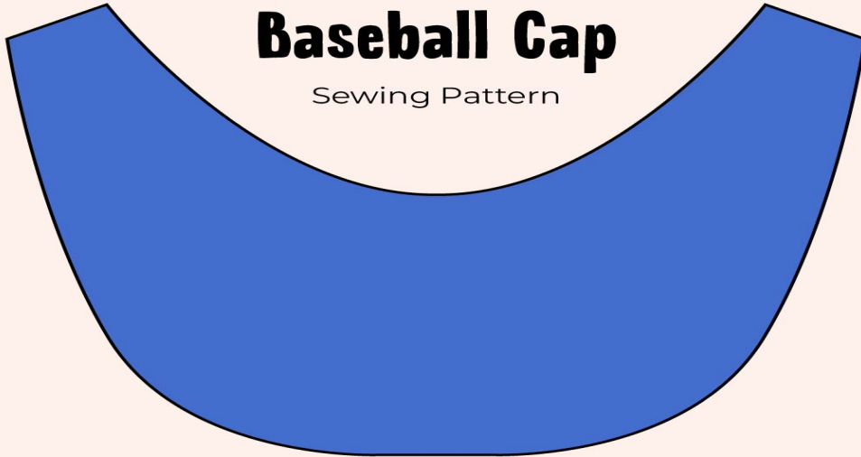
Cap Brim Cut 2 of fabric Cut 2 or more of interfacing