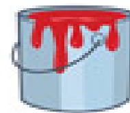
Paint (inside the can)