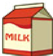
Milk (inside the carton)