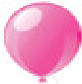
Air (inside the balloon)

Draw a line to match the objects and their correct state of matter.