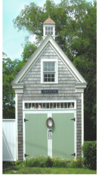
The actual studio on Cape Cod. Your model will look just like it (only smaller and made of paper)