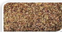
BLACK PEPPER POWDER