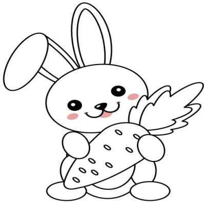
Color the Easter Bunny