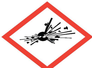
Explosive Self-reactive Organic peroxide