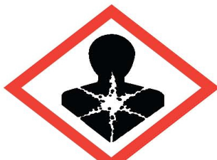
Carcinogen, Mutagen, Reproductive toxin, Respiratory sensitizer, Toxic to target organs, Toxic if aspirated