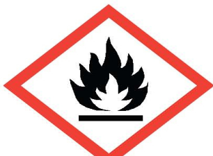
Flammable, Self-reactive, Pyrophoric, Self-heating, Emits flammable gas, Organic peroxide