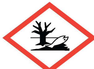
Toxic to aquatic life (optional)

SAFETY-FAX™ ... makes science teaching easier.