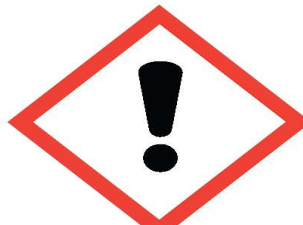
Acutely toxic (harmful), Irritant to skin, eyes or respiratory tract, Skin sensitizer