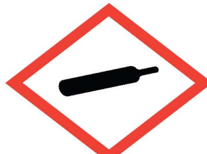
Gas under pressure