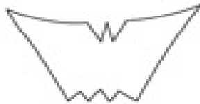
Brow: brown on brown paper (1 piece)