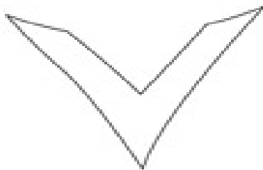
Beak: orange on orange paper (1 piece)

Arrows indicate which direction the grain should run. Sizing instructions: Print this template sheet, and photocopy it at the percentage specified for your treat box (3 1/4-inch pinecone and 3-inch egg: 100 percent; 4 1/4-inch pinecone and 4-inch egg: 120 percent).