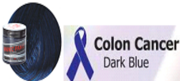
Colon Cancer Dark Blue