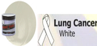
Lung Cancer White