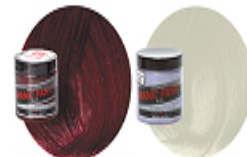
Head/Neck Cancer Burgundy/Ivory