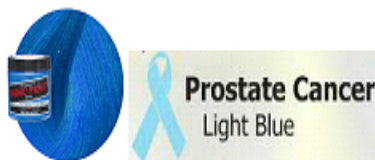
Prostate Cancer Light Blue