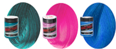
Thyroid Cancer Teal/Pink/Blue