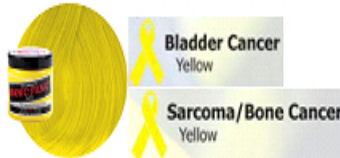
Bladder Cancer Yellow