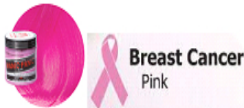
Breast Cancer Pink