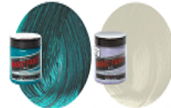
Cervical Cancer Teal/White