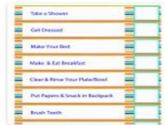
Before School Routine