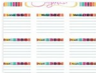
Purse Organizing Printable