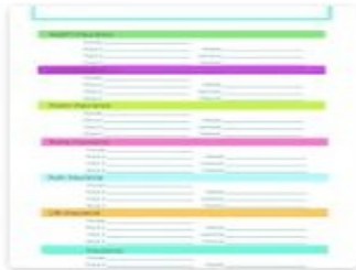
Free Insurance Tracker