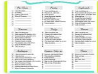
Spring Cleaning Checklist