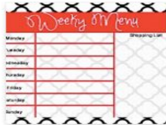
Weekly Menu Planner