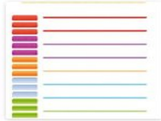
Basic To-Do List