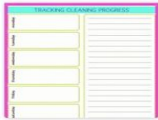
Weekly Cleaning Schedule