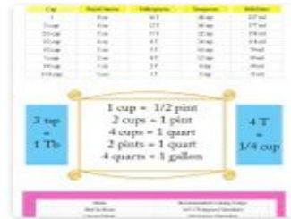
Kitchen Conversion Chart