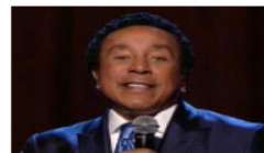
Born in 1940