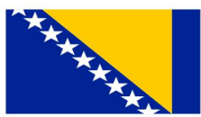
BOSNIA AND HERZEGOVINA