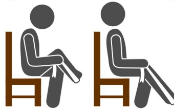
Seated Leg Press