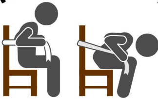
Seated Abdominal Press